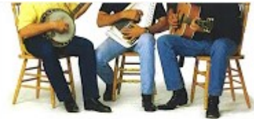
the good brothers one true thing

DS double toe step H heel xif cross in front R rock Sl slide xib cross in back S step T toe b in back or back Sto stomp Sn snuff (p) pause Dt double toe Brk break Ba ball Sk skuff