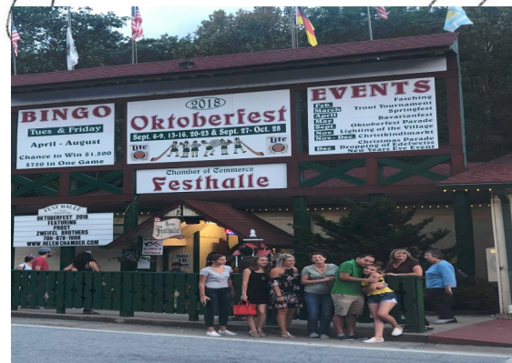
October Fest Fun