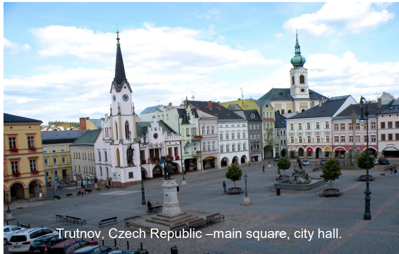
Trutnov, Czech Republic –main square, city hall.

tury when the owners of the Adrspach domain began to build the first network of pathways weaving through a variety of natural rock formations. It is now an amazing national park where we spent an entire day hiking and picnicking with our gracious hosts.”