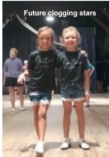
Future clogging stars