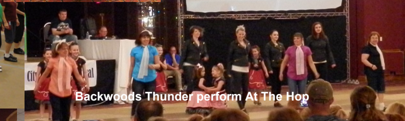
Backwoods Thunder perform At The Hop