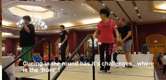
Cueing in the round has it's challenges...where is the 'front'!