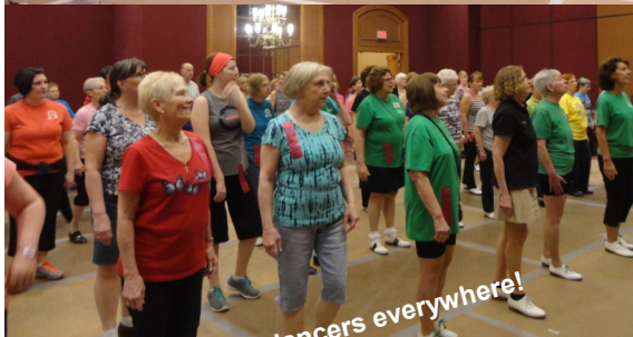
Dancers, dancers everywhere!