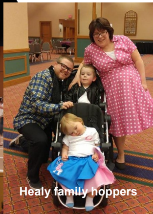
Healy family hoppers