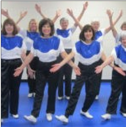
Carolina Classic Cloggers

REPRINTED FROM JULY 1, 2016 BY CAROLINAWEEKLY