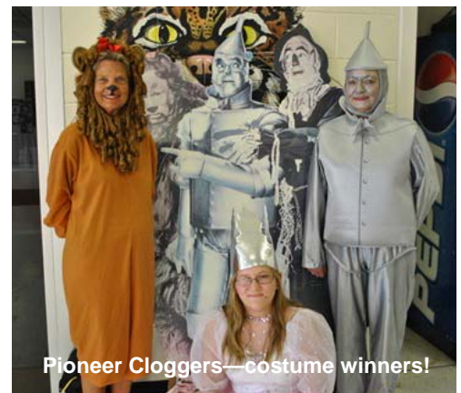
Pioneer Cloggers—costume winners!

This is a Square Dance/Clogging convention. Each year the square dancers make every effort to combine the two groups. Saturday evening each group takes time to watch the other dance. There is even talk of moving the clogging demos to the gym where the square dancing takes place. The convention always has a theme. This year's theme Fairy Tales included Fairy Godmothers' Raffle, Cinderella Dance, Princess and Frogs Fundraiser, and a costume contest. Dressed as Oz characters the winners of the costume contest were the Pioneer Cloggers from South Park, PA.