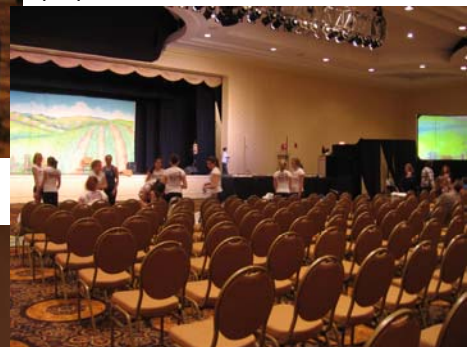
Groups await their turn to rehearse on stage.