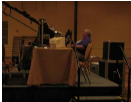
Terry Glass working on audio/visual cues during rehearsal