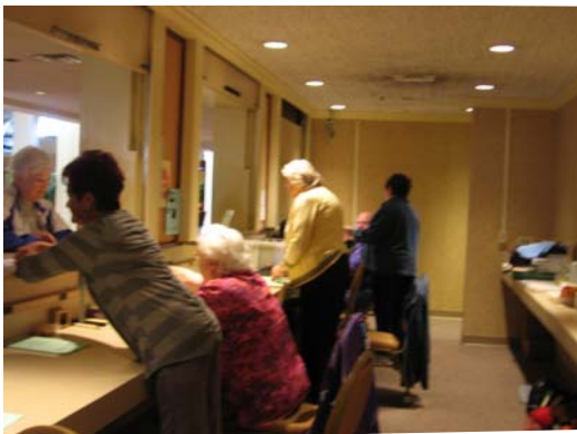
Registration in full swing!

There is a science to laying that flooring and getting it taped in place so that it does not 'walk' while they are pounded over the course of 3 days. It has to be determined how many sheets go to each hall – we only have so much to go around. The week of convention arrives! On Monday all of the supplies arrive from the warehouse and get unloaded and moved close to the areas things will be needed. The floor crew shows up first thing on Tuesday morning. Lots of tape and crawling around on the floor ensues. 9 halls and 2 days later the job is complete and ready for the dancers! In the meantime, there is frenzied work all around the convention facility. Vendors setting up their wares, registration areas being stocked and readied, and the show arena begins setting up the stage. There are