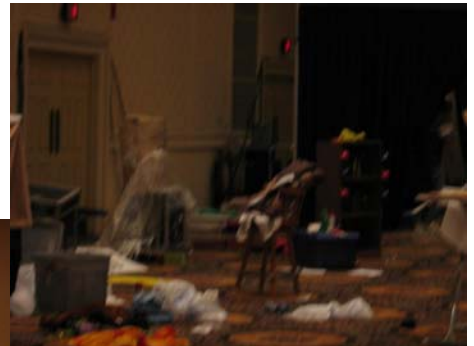
Props, boxes, equipment scattered as preparation continues