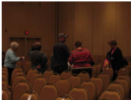
Above: Volunteers label seats in the show arena.